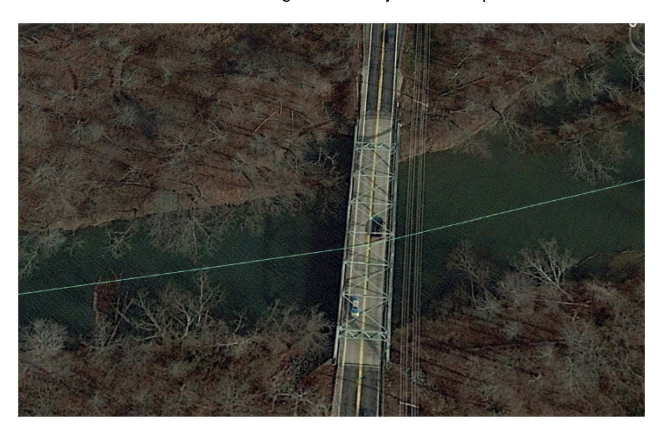
Shortly after the bridge there is a traffic light at Patuxant River Road where you will turn right. Next make a very hard, left turn onto Queen Anne Bridge Road shown below.

Lets start with Largo. If you have good access to MD Route 214, take it going east. Pass "Six Flag America", and continue till you cross the bridge to Anne Arundel County. Below is an overhead view of the bridge. The county line is mid-span on it as shown.